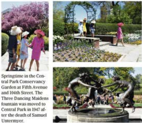
Springtime in the Central Park Conservancy Garden at Fifth Avenue and 104th Street. The Three Dancing Maidens fountain was moved to Central Park in 1947 after the death of Samuel Untermyer.