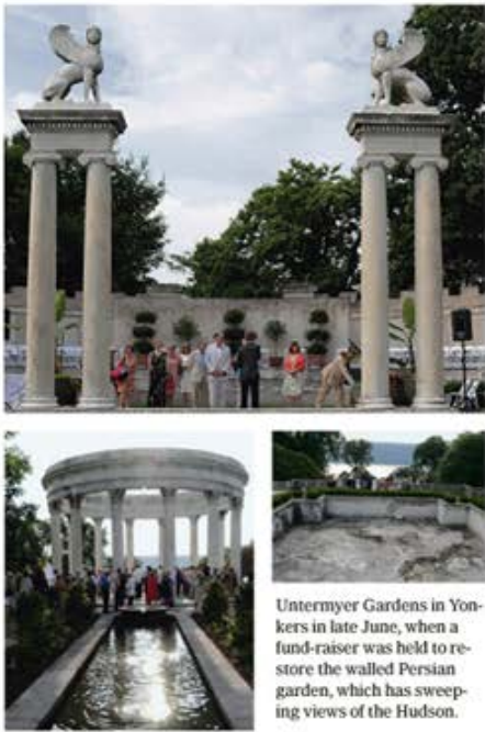
Untermyer Gardens in Yonkers in late June, when a fund-raiser was held to restore the walled Persian garden, which has sweeping views of the Hudson.