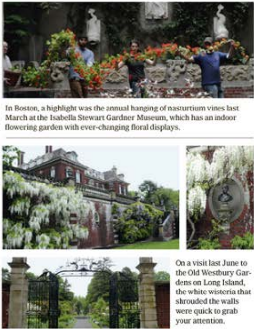
In Boston, a highlight was the annual hanging of nasturtium vines last March at the Isabella Stewart Gardner Museum, which has an indoor flowering garden with ever-changing floral displays.