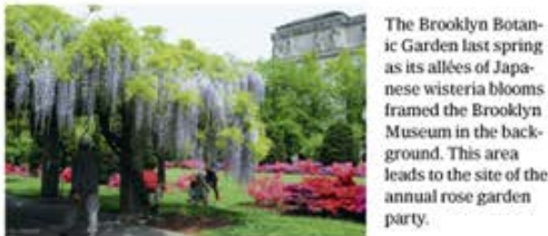
The Brooklyn Botanic Garden last spring as its allées of Japanese wisteria blooms framed the Brooklyn Museum in the background. This area leads to the site of the annual rose garden party.